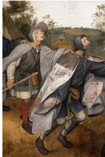
"Can a blind person guide a blind person? Will not both fall into a pit?"

The final parable, which we do not read today, is about building on the solid foundation of rock and not on sand. This is the only way to face the difficulties a disciple will encounter and survive.