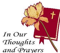
In Our Thoughts and Prayers

Please Patronize Our Advertisers, and Let Them Know You Appreciate Their Support of Our Parish Bulletin Place your ad here! Commercial Ad - $60.00 (Color $100.00)-per year Memorial Ad - $30.00 Per year Please contact the Office